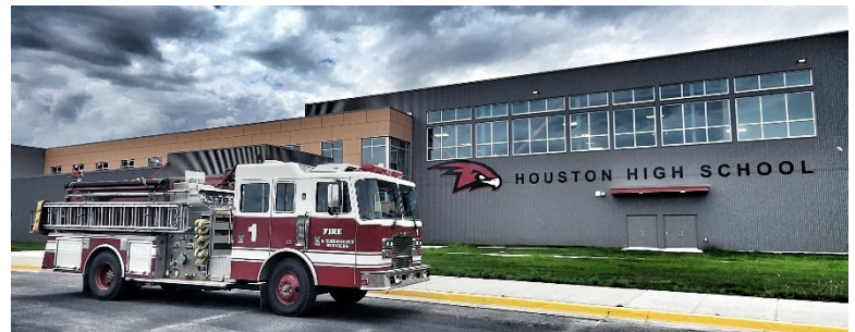
Engine 9-2 at Houston High School for a Sprinkler Activation Alarm

And although not in June, we would be remiss not to mention that we hosted another spectacular Waterworks Show squirt gun scuffle at the park in front of Fire Station 9-1 on July 4. It was attended by about 160 people and featured slides, snacks, drinks, and squirt gun battles for all ages. The sun even visited for an hour during the event.