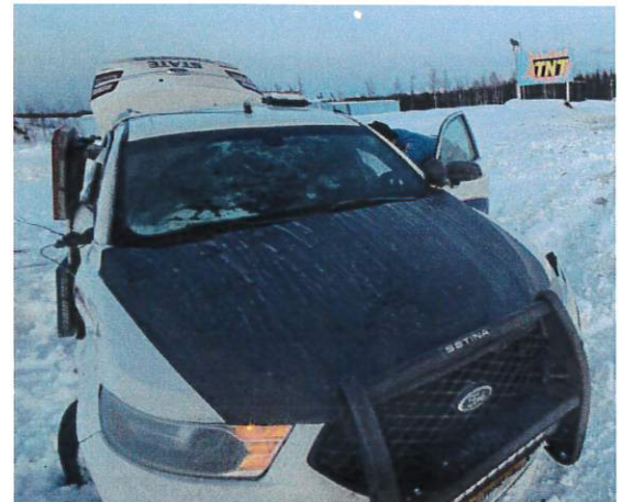
Trooper car damaged in rollover accident

2021 has been a welcome reprieve of the unpredictability of 2020. Many of the calls in March have been unremarkable with a few notable exceptions including one incident involving an Alaska State Trooper that experienced a rollover accident near the intersection of Parks Highway and Big Lake Road. The department is very much looking forward to the completion of that project for the safety of public safety and the general public.