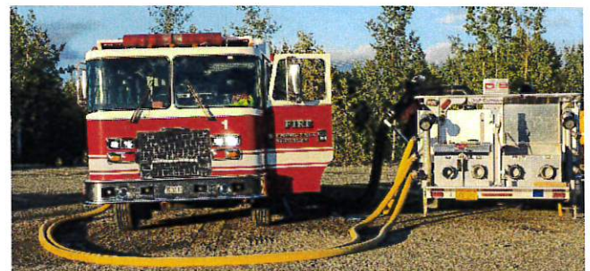
Pumper service testing on Engine 92

At the end of September is a week-long statewide conference hosted by the Alaska Fire Chief's Association. I was again invited to speak at the conference on the topics of alternative procurement, community service, and water supply tactics. I will be in Fairbanks area for the days of September 26-30 to provide this education and take classes from other national experts on topics that will benefit our department. During this time, I will also be attending the Governor's Alaska Fire Standards Council fall meeting as I was re-appointed by Governor Dunleavy to the seat.