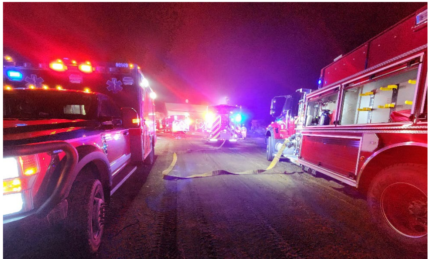
Tender 92 assisting on a mutual aid fire

We installed two carbon monoxide alarms, three smoke alarms, and also responded to several carbon monoxide calls in April. Never let your guard down, and keep those alarms installed and tested.