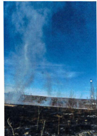
Smoke whirl rising from grass fire

We cannot stress enough that you are responsible for any fires that you ignite, whether the spread is intentional or not. The first fire was within danger zone of igniting a patch of beetle-killed spruce and black spruce trees which could have been disastrous, and the second fire happened in the heart of the Miller's Reach Road subdivisions which still have the memory of 1996's Miller's Reach #2 wildfire.