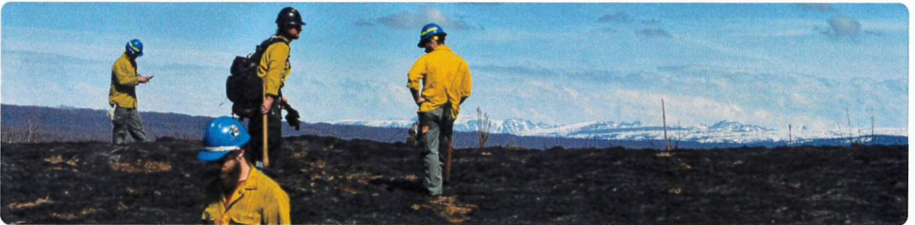
Firefighters attack and overhaul a grass fire on Millers Reach Road