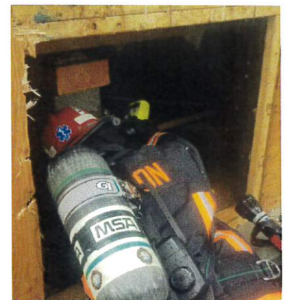
Lt Russell extinguishing fire in a crawl space

But it wasn't just fires. Houston also experienced several vehicle incidents such as a driver having a diabetic emergency and thankfully slowly driving into the ditch near Rel Street where they were provided with emergency medical care and made a full recovery. Another accident within 48 hours only one curve away from that site involved a young driver striking a moose on a blind corner and being knocked unconscious while the car continued to drive another quarter mile until it struck trees extremely hard and that driver sustained serious injuries. They were transported without incident and despite the amount of injuries was returned home the next day.