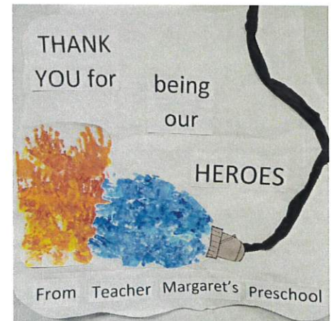
"Thank You" poster made by preschool class