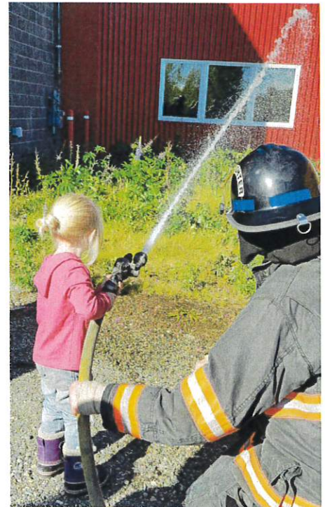
Preschooler getting hands-on with fire hose

The Nixle alert on last Monday about the city's election day sent 4,446 text messages, 6,665 emails, and 439 app push notifications. These app notifications are a recent addition to the Nixle platform. This shows just how popular Nixle has become and how effective it can be to send out messages about emergencies, disasters, road closures, and events like elections.