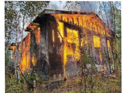
Larae Rd fire remains under investigation

But it wasn't just fires. Houston also experienced several vehicle incidents such as a driver having a diabetic emergency and thankfully slowly driving into the ditch near Rel Street where they were provided with emergency medical care and made a full recovery. Another accident within 48 hours only one curve away from that site involved a young driver striking a moose on a blind corner and being knocked unconscious while the car continued to drive another quarter mile until it struck trees extremely hard and that driver sustained serious injuries. They were transported without incident and despite the amount of injuries was returned home the next day.