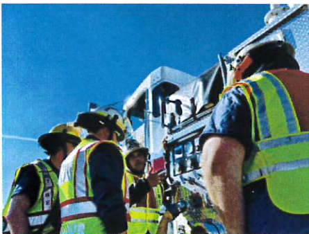
Engineers being trained in recent course

It is extremely easy to sign up to receive Nixles from City of Houston by texting HOUSTONAK to 888777, and then you can sign up for any ZIP codes you want to receive alerts for. The most common for our area are 99694 (Houston), 99652 (Big Lake), 99688 (Willow), and 99623 (regional physical address ZIP code).