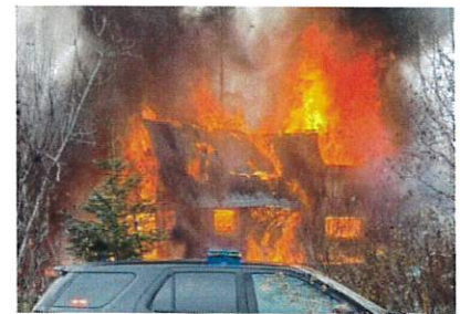
A recent fire in Willow fully involved

Recent fires of note include a residential fire in Willow that our apparatus was the second firefighting apparatus on scene and assisted in knocking the blaze down to a manageable size, the Larae Rd fire mentioned at the last council meeting which remains under investigation by the State of Alaska Fire Marshal's Office due to circumstances discovered during our initial investigation, and an alleged arson in Meadow Lakes in which a resident attempted to evade law enforcement officers by igniting the home on fire. There were no injuries in either of the latter fires, but the Willow fire did have one firefighter sustain minor injuries to a leg as well as the civilian fatality. Another residential fire up in Willow with no injuries involved the homeowner making firestarters with wood chips. While melting wax, the candle was left unattended and ignited a fire in the garage that the resident discovered shortly after and notified 9-1-1 immediately. That early notification allowed for a quick response and extinguishment, saving the home and limiting the damage to the garage to smoke and heat.