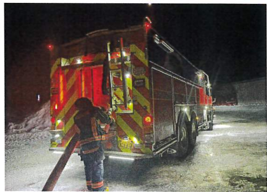
Firefighter Beard filling up a fire tender for a structure fire

January was a fairly uneventful month locally despite the turmoil of our mutual aid areas and the recent cold snaps, windy weather, and rain. A few calls of note include a very large abandoned structure in Big Lake that is under investigation still by appropriate agencies, and a very uncommon call near Parks Highway and Big Lake Road. In that call, an employee of a contractor experienced a seizure while working on the roof of a commercial building being expanded. That person was removed from the roof with assistance from other employees of the same company and an on-site lift trailer. Had we not had this equipment available, we would have had to bring the worker down using traditional ladders and carrying the patient. These are the types of calls where a ladder truck would provide a much safer work environment, but to have a ladder truck respond we would have to dispatch one from either West Lakes or Central Mat-Su fire departments because we do not have one.