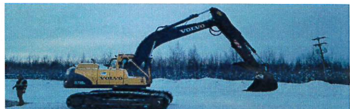
Equipment obtained from JBER at no cost to city

Also of note was the fact that we got a full-size excavator for free from Elmendorf due to its surplus status for them. This will be used for grounds maintenance around the fire stations, wildfire mitigation projects, and has potential to be rented to Alaska’s Division of Forestry for mopup after fires which could bring in a significant income to the city.