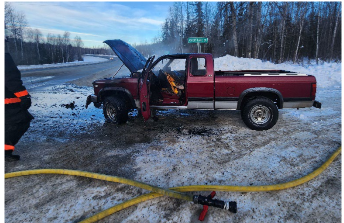
Remnants of a vehicle fire extinguished near Cheri Lake Rd

Additional calls of significance were a shop fire on Millers Reach Road, a few mutual aid calls to the same structure in Meadow Lakes, a chicken coop fire caused by a heat lamp that fell into straw, and the serious medical calls.