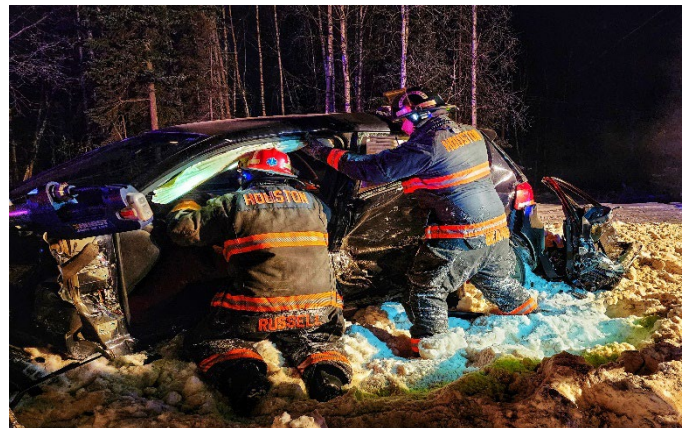
Firefighters work to remove an entrapped person near Cheri Lake Rd

The beginning of the year was typical - extrication calls and structure fires. This included a very serious car accident at Parks Highway's intersection with Cheri Lake Road. The City already has a streetlight at the intersection as Cheri Lake Road is within the city, but the rest of the highway in both directions is unlit and difficult to travel in icy and wet conditions. The areas are within State jurisdiction. Houston Fire responds to multiple vehicle collisions annually at this intersection; some striking moose, some striking vehicles such as the very significant T-bone collision this last month, and sometimes it's a vehicle having an isolated incident. The Parks Highway corridor between Debra Jean Dr and Gaunt Lane is fraught with accidents annually, including fatalities.