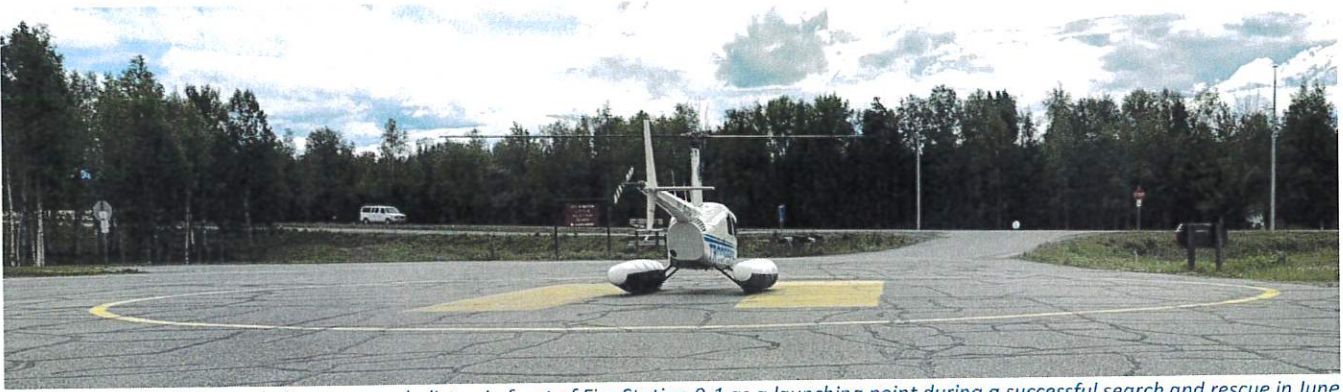
Alaska State Trooper helicopter uses helistop in front of Fire Station 9-1 as a launching point during a successful search and rescue in June