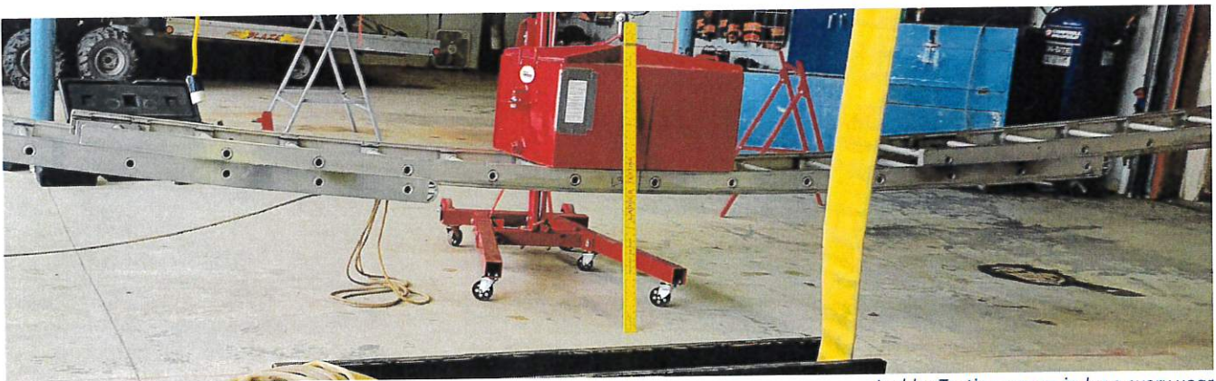
Ladder Testing occurs in June every year